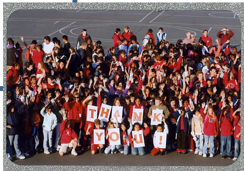
John R. Williams Students Thank You for New & Modernized Buildings

For more information visit: www.lusd.net (select "Bond Information")